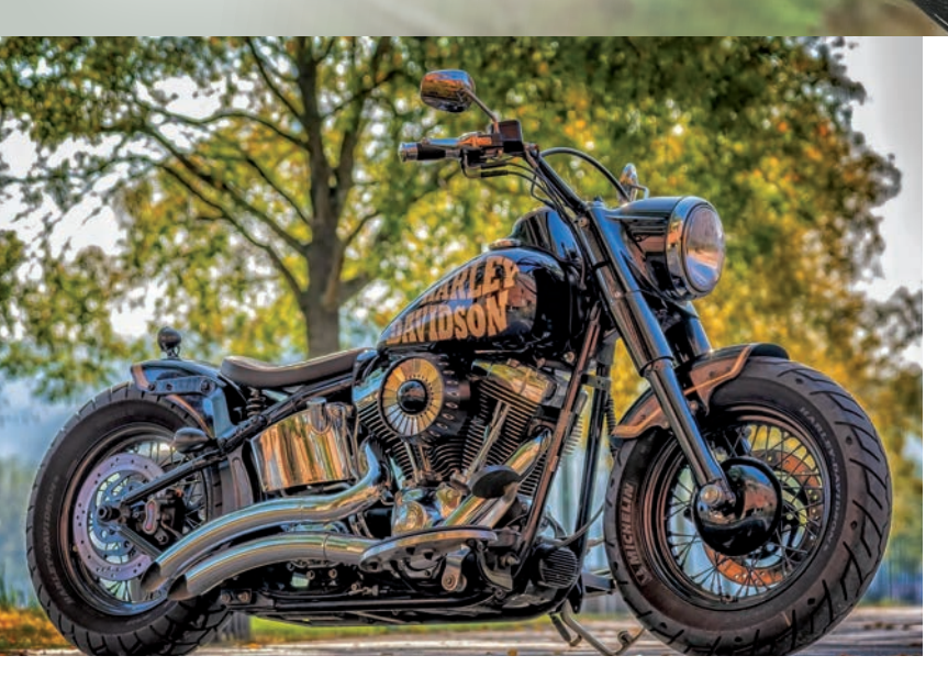
The 2022 Motorcycle Giveaway is sponsored by the National Academy of Motorcycle Injury Lawyers.

Bretz Injury Law 3 Compound Dr Hutchinson, KS 67502