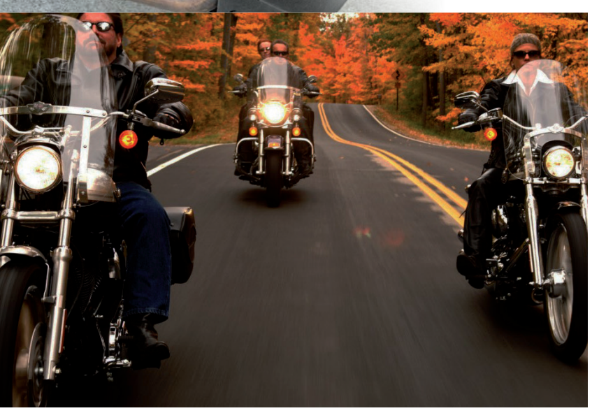
Bretz Injury Law 3 Compound Dr Hutchinson, KS 67502

© Copyright 2021. Premier Print Marketing. Printed in the U.S.A. www.PremierPrintMarketing.com The information included in this newsletter is not intended as a substitute for professional legal advice. For your specific situation, please call the appropriate legal professional.